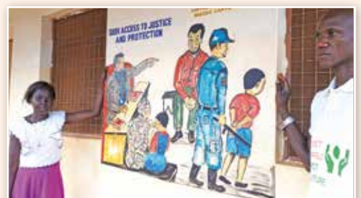
5. "The mother has taken the case to the court for justice, the lawyer here has told the policeman to go and arrest the boy."