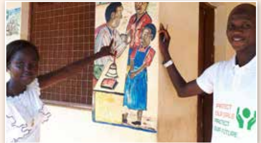
2. "This is how it is reported, you go to people of concern, in this case the girl is reporting to her teacher."