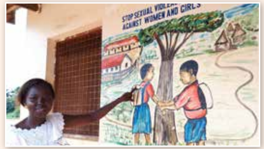
1. "This is how rape starts. It shows a boy grabbing a girl to sleep with her by force".

"As a group of youth facilitators after the training we wanted to put something up to show what has to happen when there is a case of GBV. We wanted to make it simple to understand. We held a meeting, drew a sample and gave it to the artist. We wanted it put at the health clinic because it's a public place where people come. The feedback is that people were very happy to see them, to see the procedures they can make. My hope is it will help to reduce the cases. That people who are thinking of doing such things will see these pictures and fear."