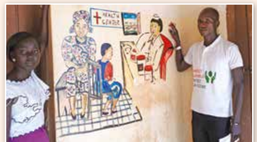
4. "The mother has followed the daughter here. You can see she looks upset. She heard the girl was there and now the doctor is explaining what happened."