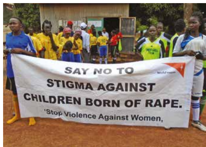
ABOVE: Youth led sport matches as a forum to raise awareness about the harms of stigma and different forms of GBV as part of the Magna Carta project.

Many women's groups spoken to, whether involved in the project or not, were in existence before the project began. They were credited with undertaking strong advocacy on prevention and treatment of GBV and support to survivors during the project and this continues. This support includes a range of activities such as counselling, awareness raising, running regular centres, dialogues with community chiefs, women's forums, and helping survivors through the referral system (with information, transport etc). However, for those who were project beneficiaries, having the ability to access and reach women through women was seen as a critical component for this project's success, particularly for adolescent girls and female youth. The women reiterated on several occasions the need for further livelihoods support for survivors, especially in relation to helping children who have been born of rape. Respondents who were not part of the project more candidly reported that support was limited, primarily to counselling and encouragement to go to hospital to seek medical services.