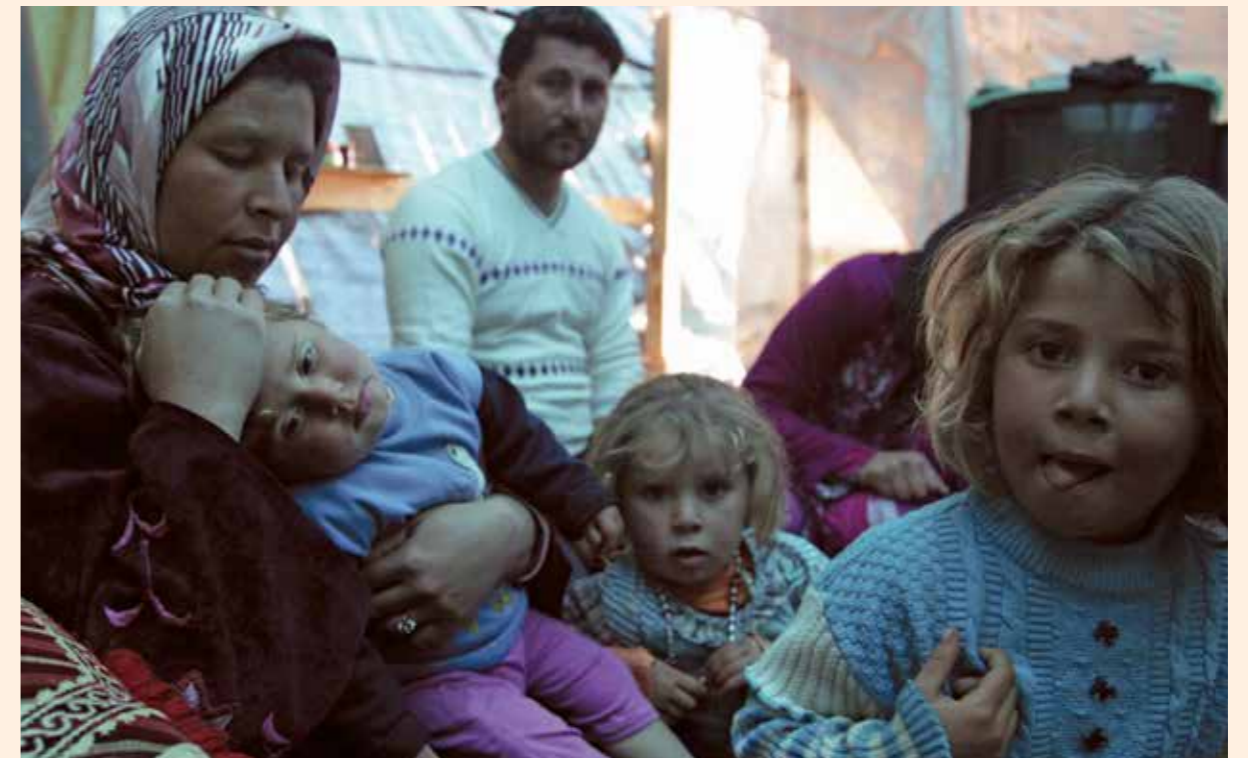
A Syrian woman cares for sick children. World Vision supports projects that enable Lebanese women to train Syrian refugee mothers on how to care for their children.

World Vision's Mothers in Action group was initially formed to work within poor Lebanese communities in the town of Kabalias in the Bekka Valley. Local women were trained in mother and child health and how to offer advice to other mothers. Access to healthcare was already poor in Kabalias before the Syrian crisis, which has seen the population of Bekka almost double, putting intense pressure on this already deprived community.