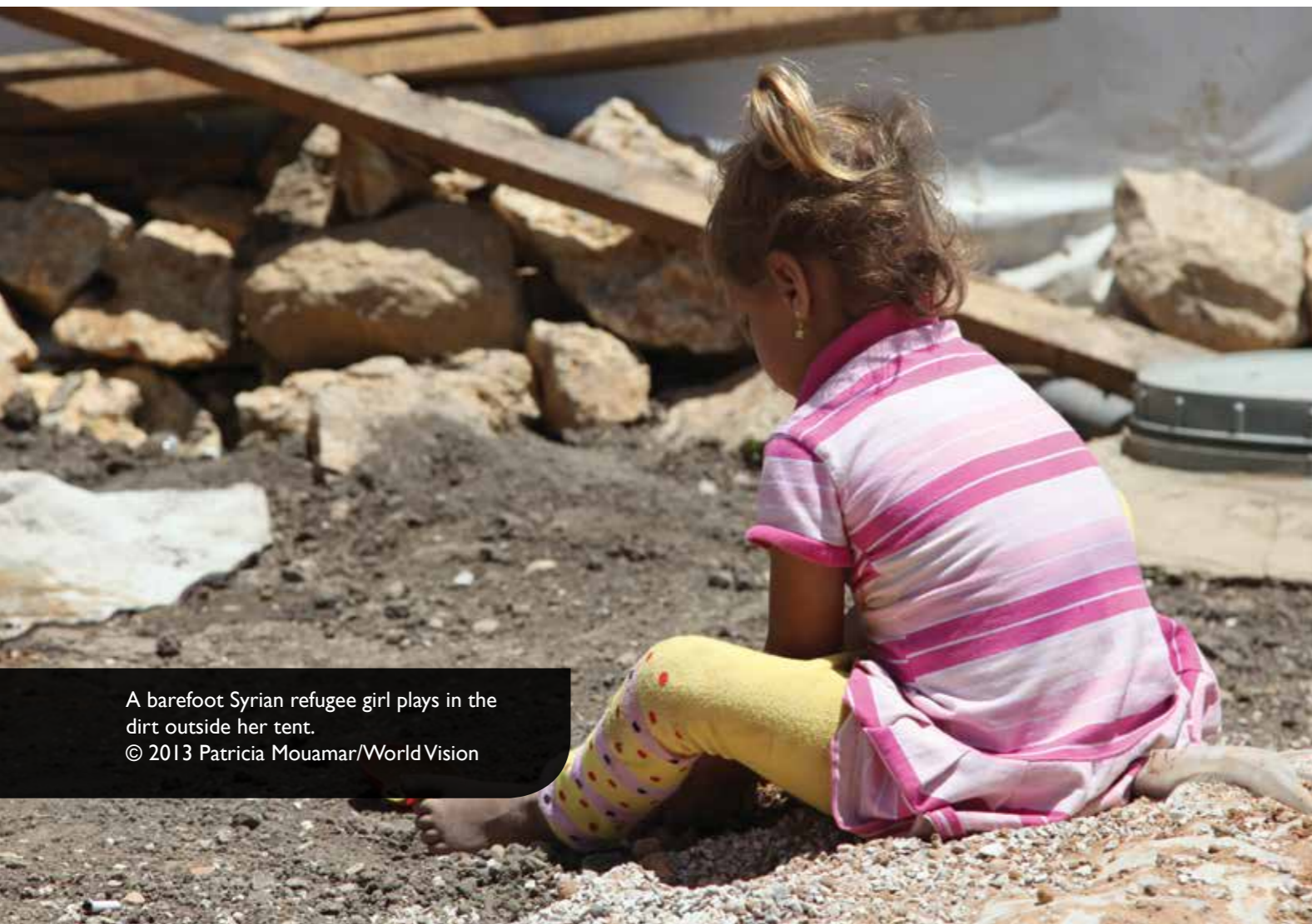
A barefoot Syrian refugee girl plays in the dirt outside her tent.