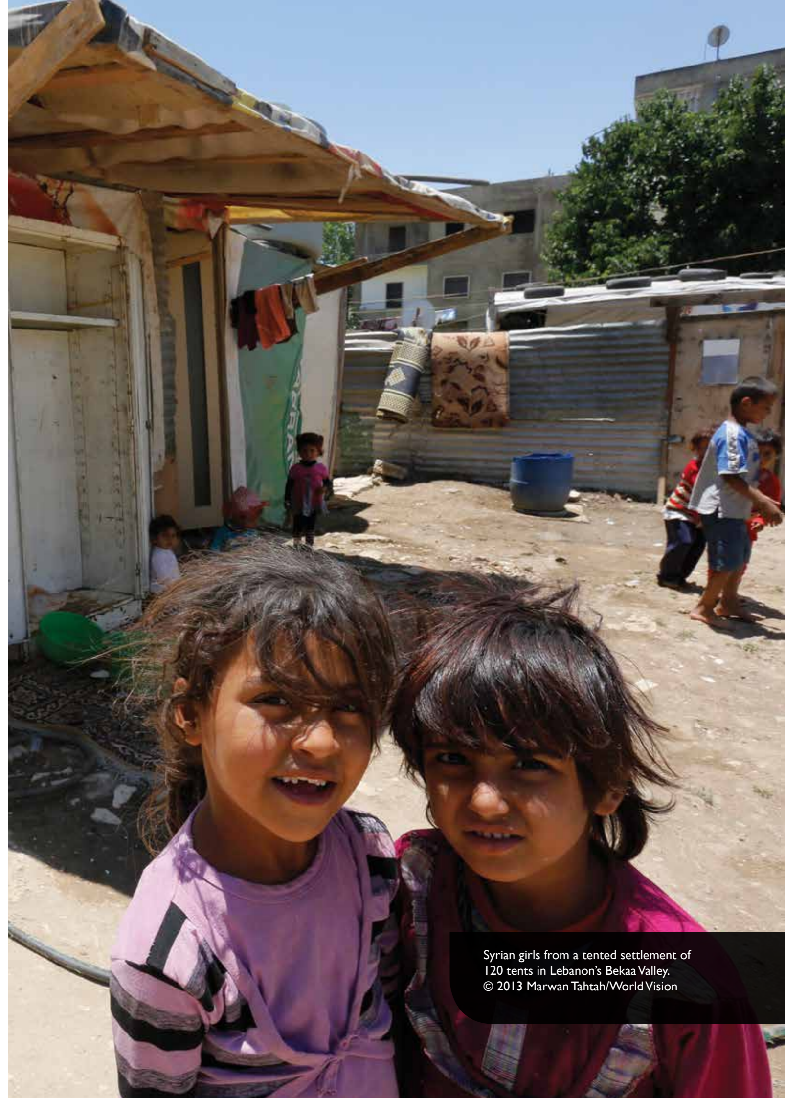
Syrian girls from a tented settlement of 120 tents in Lebanon's Bekaa Valley.