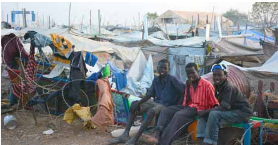
Boys gathered in a Protection of Civilians site in Upper Nile.