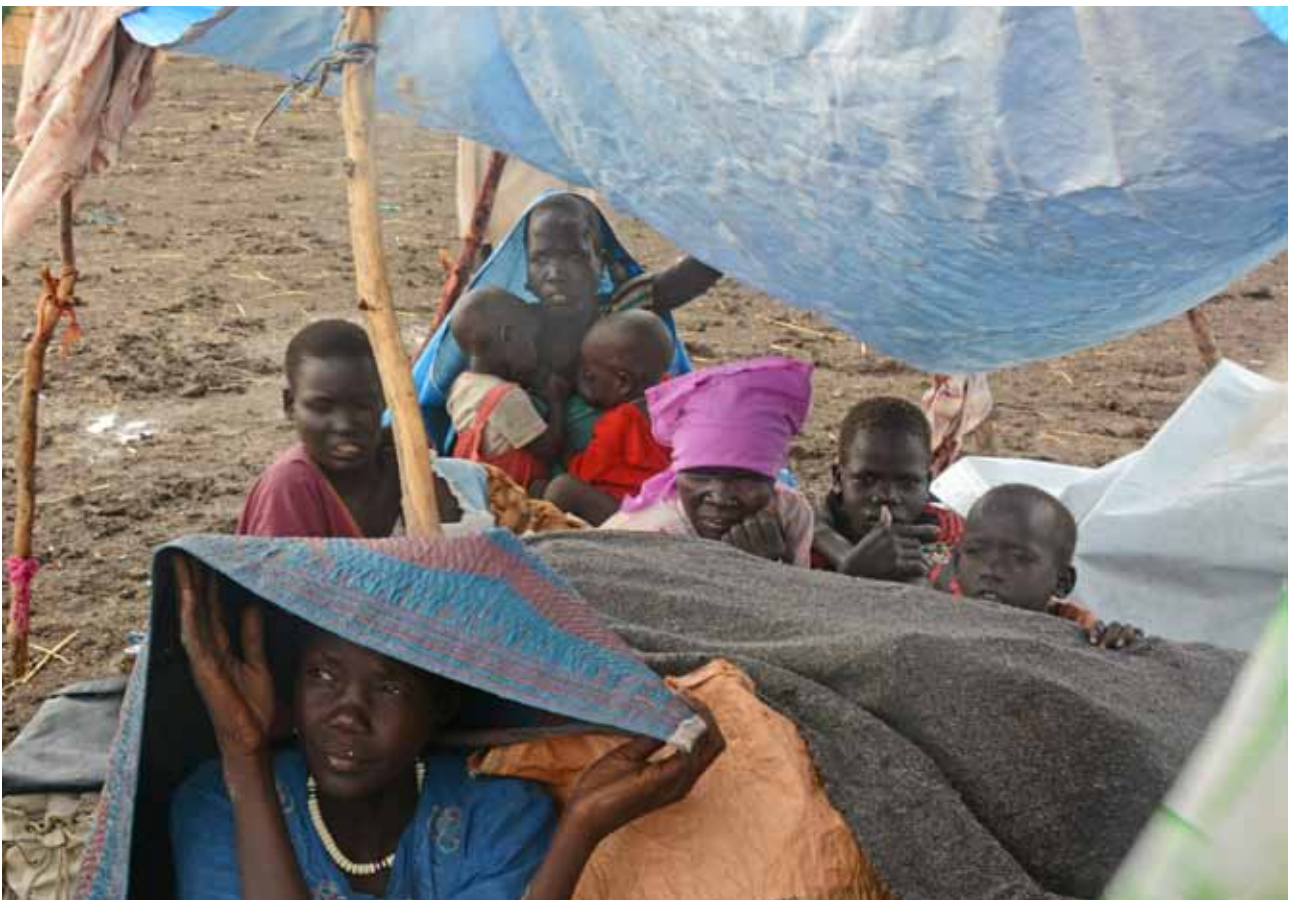
Internally displaced people living in a spontaneous settlement in Upper Nile.