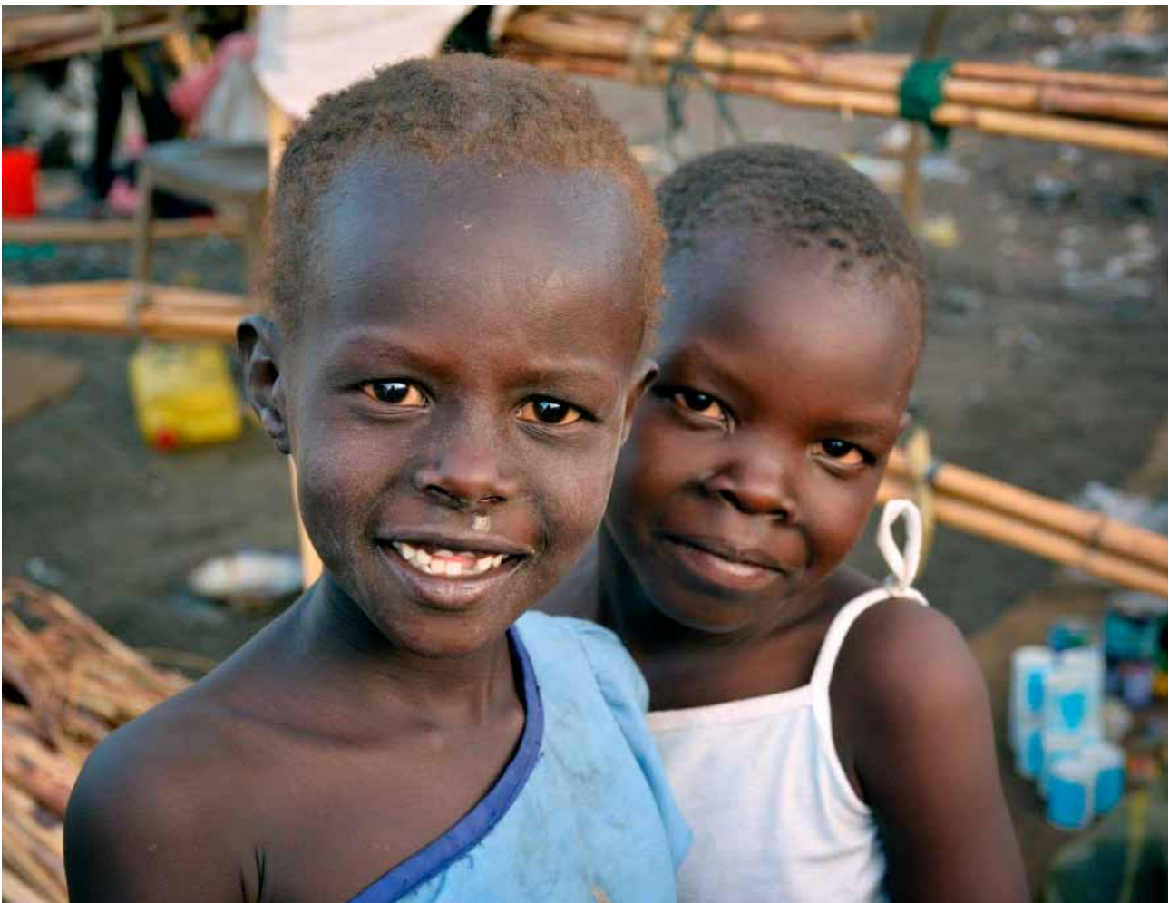
Girls playing in a Protection of Civilians site in the state of Upper Nile.

It is critical that the international community does all it can to help bring an end to the violence and ensure children and their families receive the assistance and protection they deserve. The children of South Sudan should not have to live in constant fear of attack, or endure the suffering of protracted displacement. The children of South Sudan – like all children – deserve to live in peace.