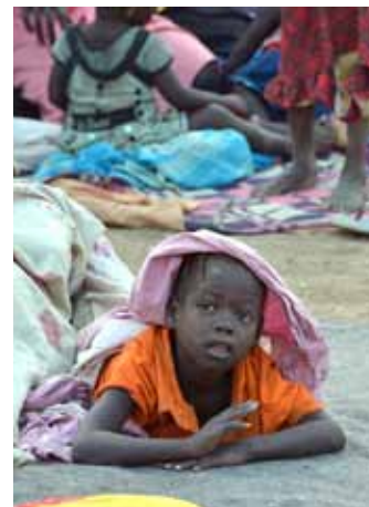
Internally displaced children sleeping in the open in Upper Nile.