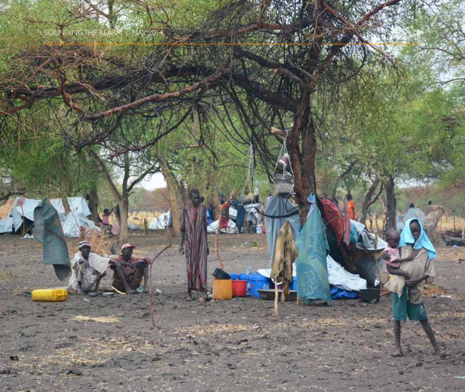
Internally displaced people living in a spontaneous settlement in Upper Nile.

people crammed into a space the size of three football pitches. Tensions are mounting as people are living in extremely confined spaces, and there is increased competition for food, water, shelter, health care and other essentials. Overcrowding will also increase the risk of disease and infection, which is likely to worsen once heavy rainfall starts in June. Many PoC sites are susceptible to flooding, so there are particular concerns about the outbreak of water-borne diseases. 23 The overcrowding is also likely to increase protection risks for the most vulnerable, particularly children and those living with disabilities. As people become increasingly frustrated with living in crowded conditions, there is a heightened risk of physical violence. Children living in confined PoC sites are displaying higher levels of psychosocial distress than children living in IDP settlements where there is more space to play. Examples of such distress include frequent crying, screaming, fighting and having nightmares. It is therefore critical for UNMISS and humanitarian organisations to work together to address overcrowding in PoC sites, including expanding the perimeters of existing sites or establishing new ones. This will help give humanitarian organisations sufficient space to deliver assistance, in line with minimum standards, and in a way that upholds people's safety and dignity.