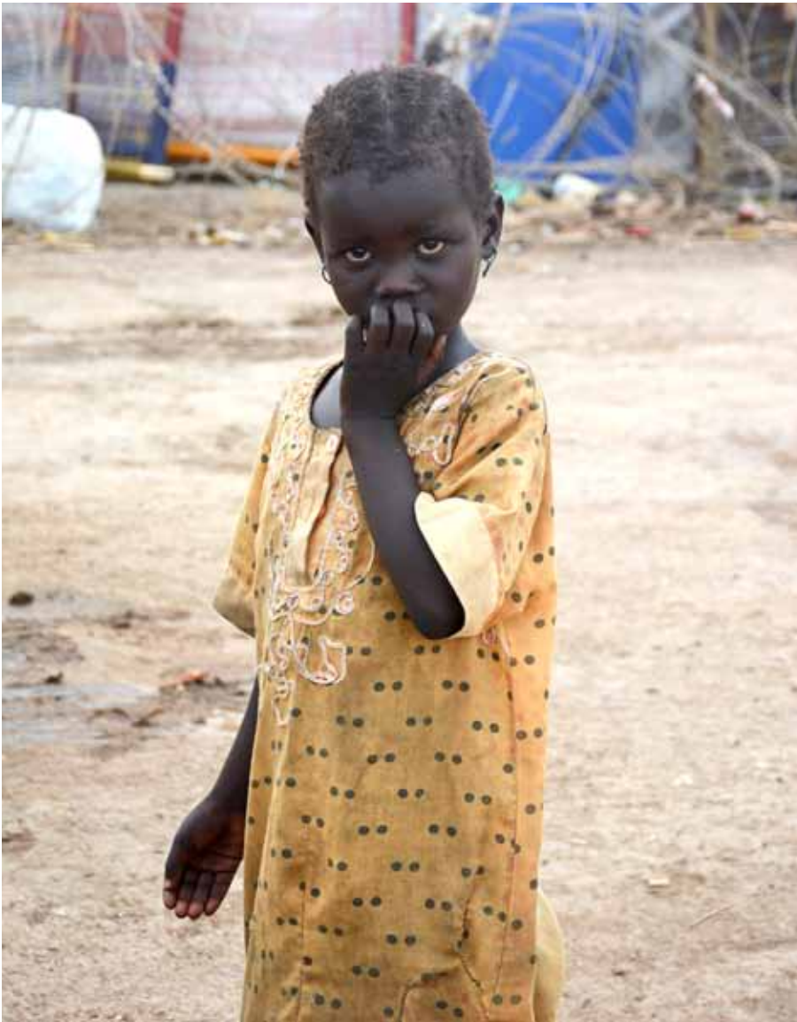
Young girl at a Protection of Civilians site in the state of Upper Nile.

Often these children have had to make frantic journeys to seek refuge, moving multiple times to flee violence. Even when they do find relative safety in a PoC site, they continue to live in fear of further attacks. The widely publicised attack on civilians at the PoC site in Bor on April 15, 2014 has caused many children to believe they are not safe even on UNMISS bases. They also fear violence and abuse from those living around them. Tensions are mounting in overcrowded