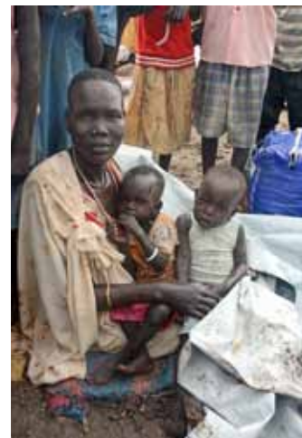
A mother nursing her children in Malakal, Upper Nile.

Humanitarian organisations are in a race against time to pre-position food, essential items and agricultural supplies before the start of the rainy season in June. Once there is heavy rainfall, much of the country's limited road infrastructure will become inaccessible, making humanitarian organisations like World Vision almost solely reliant on costly air operations to bring aid to conflict-affected areas. The hostilities have severely impeded efforts to pre-position supplies, particularly along key transport routes, which means that humanitarian organisations have been largely dependent on transporting supplies via air already,