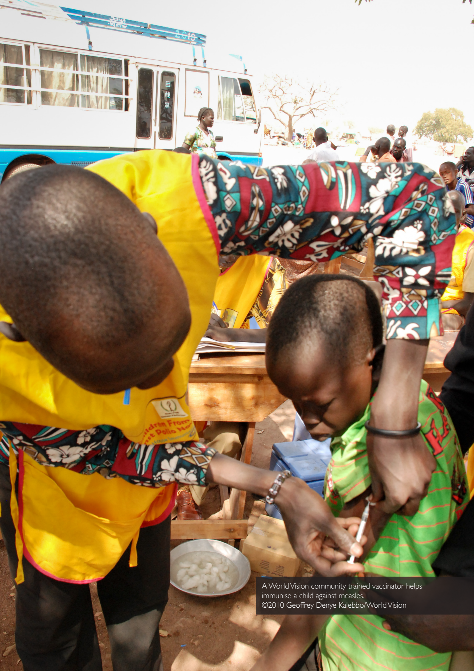
A WorldVision community trained vaccinator helps immunise a child against measles.