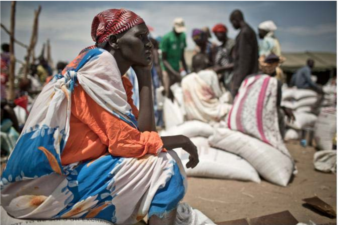
A woman waits for food in Mingkaman, Lakes state, April 2014.