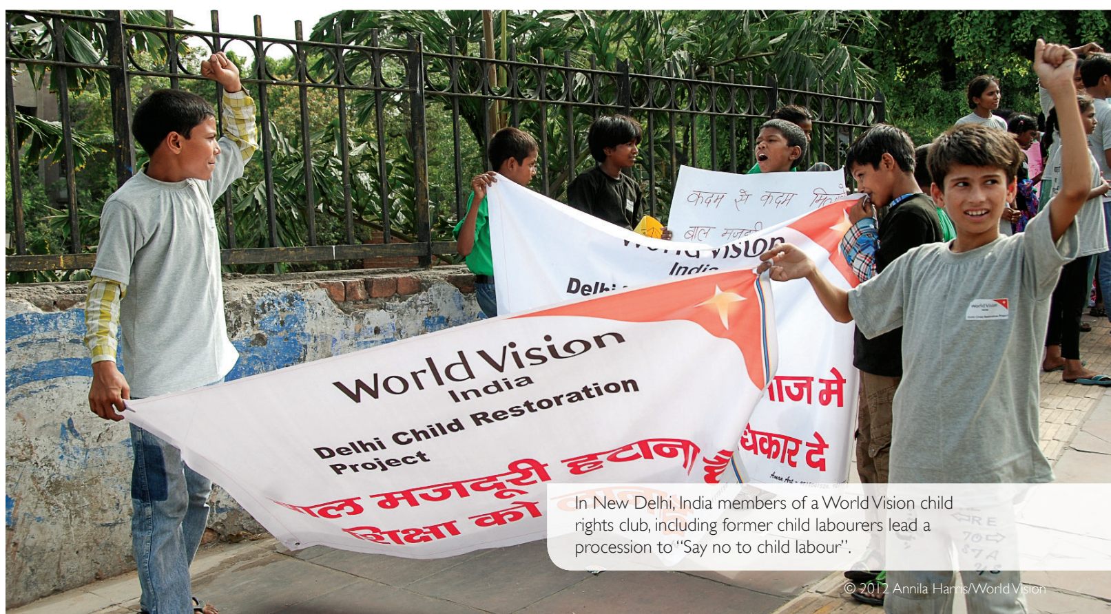
In New Delhi, India members of a World Vision child rights club, including former child labourers lead a procession to “Say no to child labour”.

Responses to CEFM also mirror the actions needed to curb child labour. Improving the quality of education and children’s access to it plays a critical role in reducing both concerns, as does community education to change the social norms that accept and encourage their continuance. Local awareness and enforcement of law is also decisive in underpinning behavioural change in the longer term.