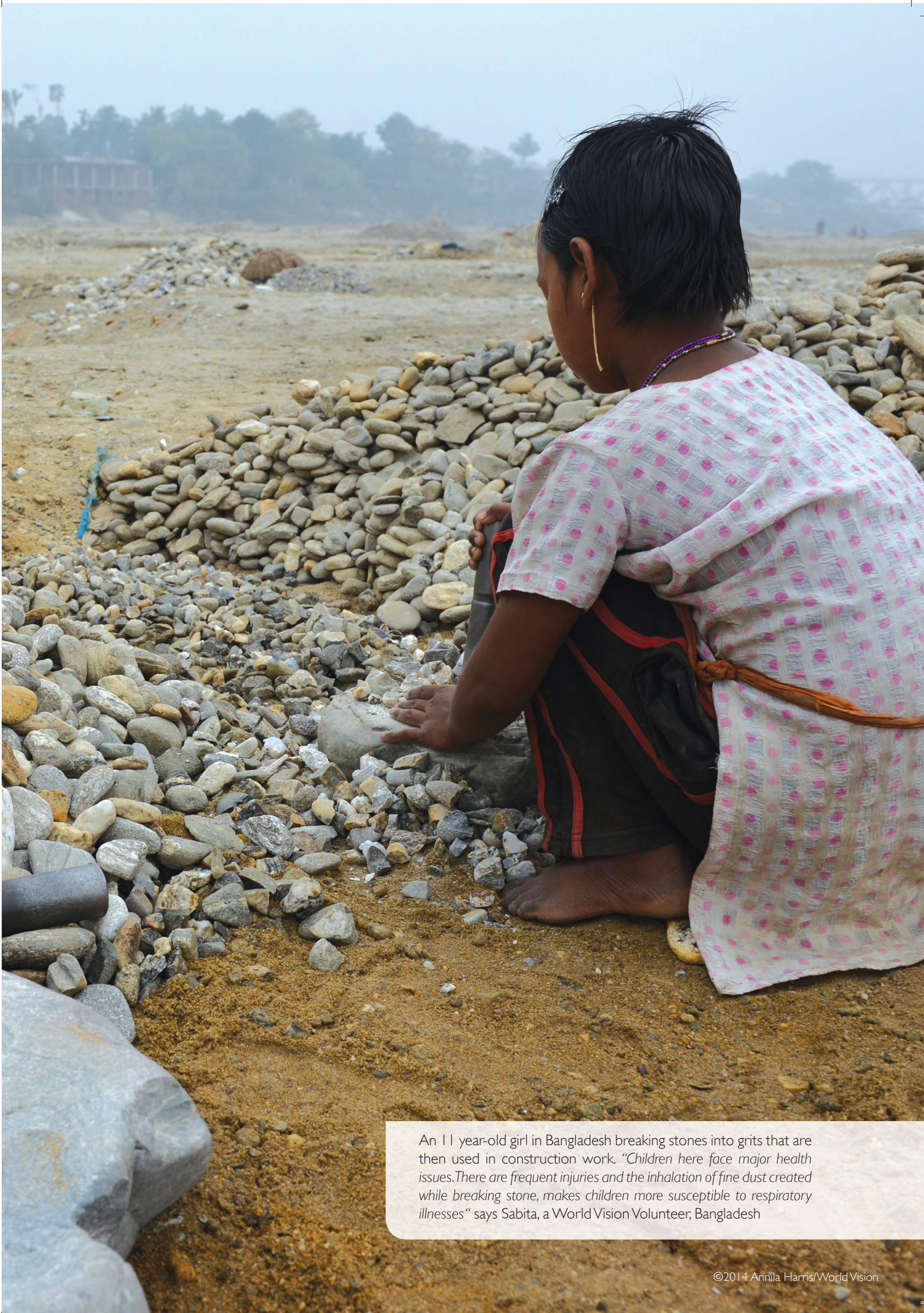
An 11 year-old girl in Bangladesh breaking stones into grits that are then used in construction work. “Children here face major health issues. There are frequent injuries and the inhalation of fine dust created while breaking stone, makes children more susceptible to respiratory illnesses” says Sabita, a World Vision Volunteer, Bangladesh