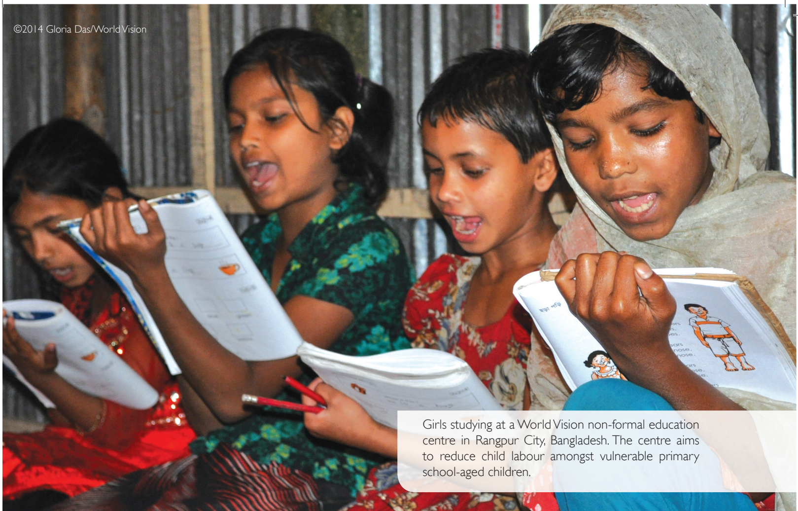
Girls studying at a World Vision non-formal education centre in Rangpur City, Bangladesh. The centre aims to reduce child labour amongst vulnerable primary school-aged children.

Members of child forums act as champions in raising awareness on various social issues such as child labour; regular attendance at school, early marriage and trafficking. These forums are designed to link to existing governmental and other structures in communities and at higher levels with a view to curbing child labour; amongst other protection issues. The forums also work to increase the awareness of peers, parents and other community members on issues affecting children and young people. In Ethiopia 'girls' rights clubs' promote continued education for girls and are motivating them to stay in school and avoid harmful alternatives of domestic labour; early marriage and trafficking.