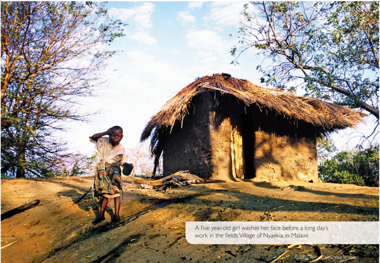
A five year-old girl washes her face before a long day's work in the fields. Village of Nyaekia, in Malawi.