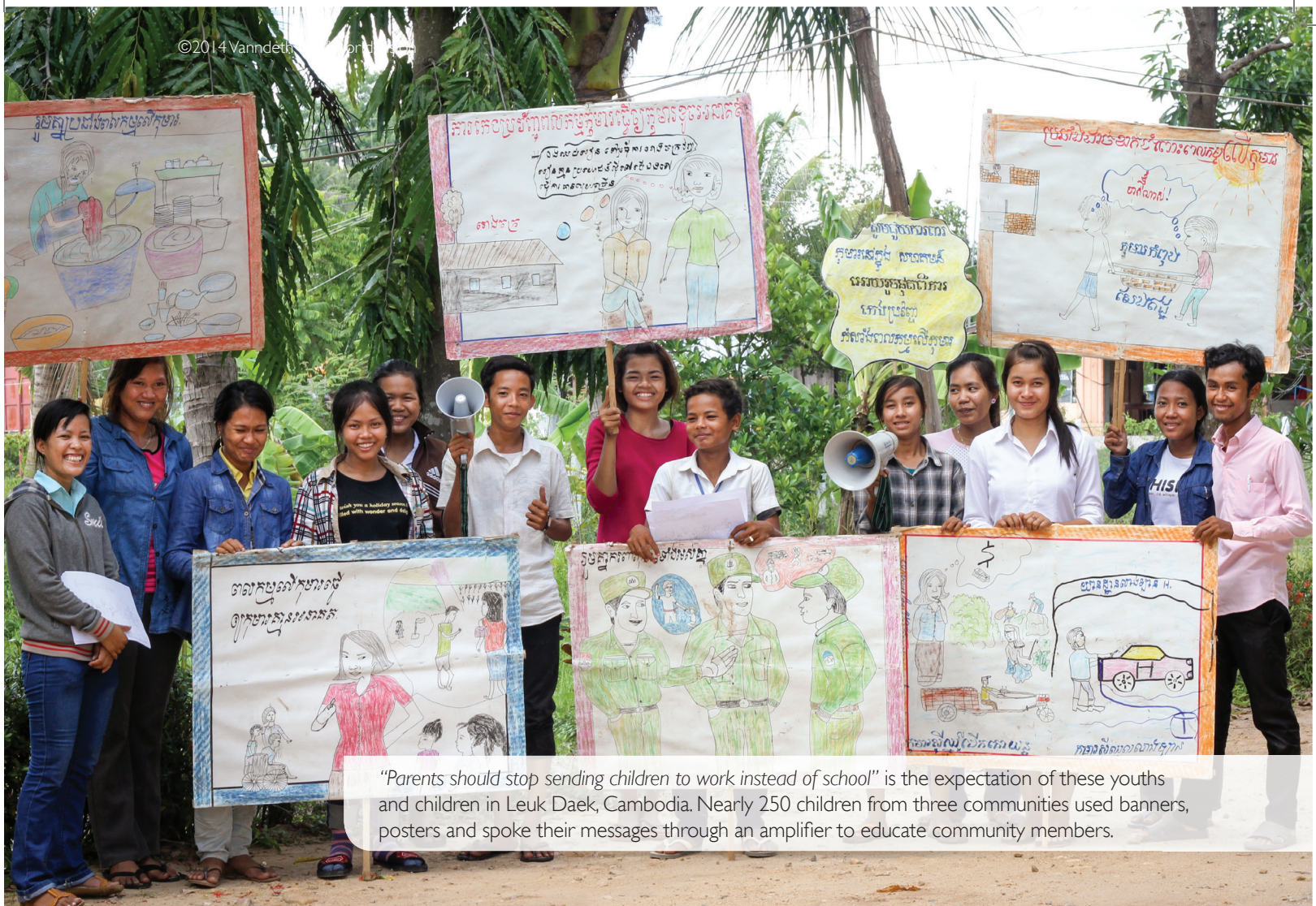
“Parents should stop sending children to work instead of school” is the expectation of these youths and children in Leuk Daek, Cambodia. Nearly 250 children from three communities used banners, posters and spoke their messages through an amplifier to educate community members.

stigmatised children in particular), reducing the cost of schooling, and creating a more accessible and conducive learning environment are all crucial factors. Pre-school education and after-school support are proving to be important ways of helping children vulnerable to child labour to succeed and excel at school. Non-formal education offers important respite for child labourers and can facilitate their transition out of child labour. Supporting the acquisition of life skills helps older children to avoid being drawn into exploitation and worst forms of child labour situations.