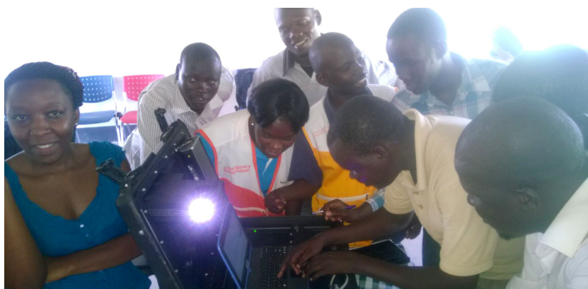
Staff of world Vision learning to operate the digischool