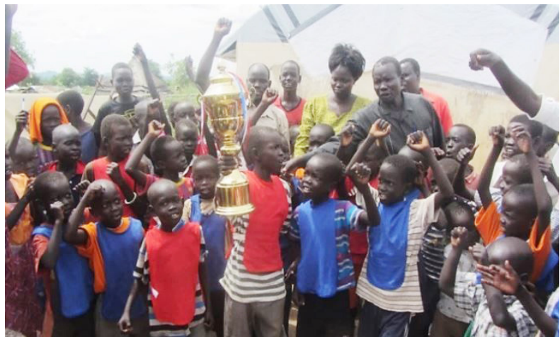
Children between the age of 3-6 years pose with their trophy after emerging champions of the global peace day in Adjumani district

Football is used as a platform for reconciliation and building relationships in Adjumani. It is a game that brings different tribes together to share moments of victory and loss. During games, children have learnt the different languages of other tribes. A case in point is a Dinka child in Alere refugee settlement who can now speak Dinka, Nuel, Madi, Arabic and Shilluk. The boy attributes learning the different languages to engaging in football games with other children. He began by learning how to say “Kick the ball here.” In Nyumanzi Refugee Settlement, children with less than five years of age at the ECD centers participated in the global peace games and emerged soccer champions in Adjumani District.