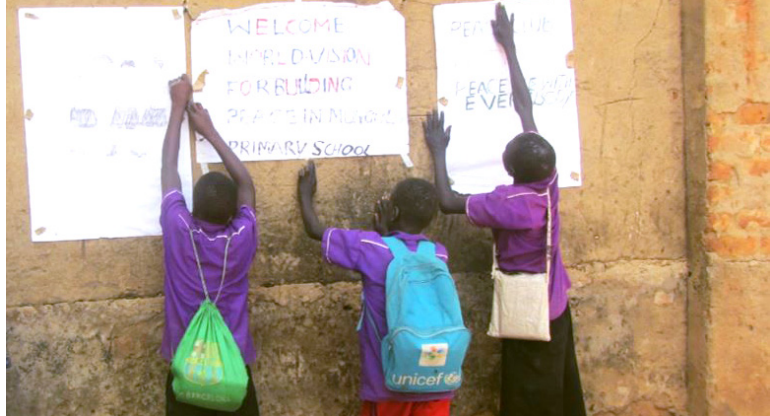
Children from Mungula 1 Peace Club displaying posters with messages of peace at their school.

language the other would think they were being mocked and insulted. Teachers would spend half of the allotted lesson time solving cases of fighting among children. Some teachers almost turned down their appointments for fear of the conflict situation in this school. One teacher shared his worries.