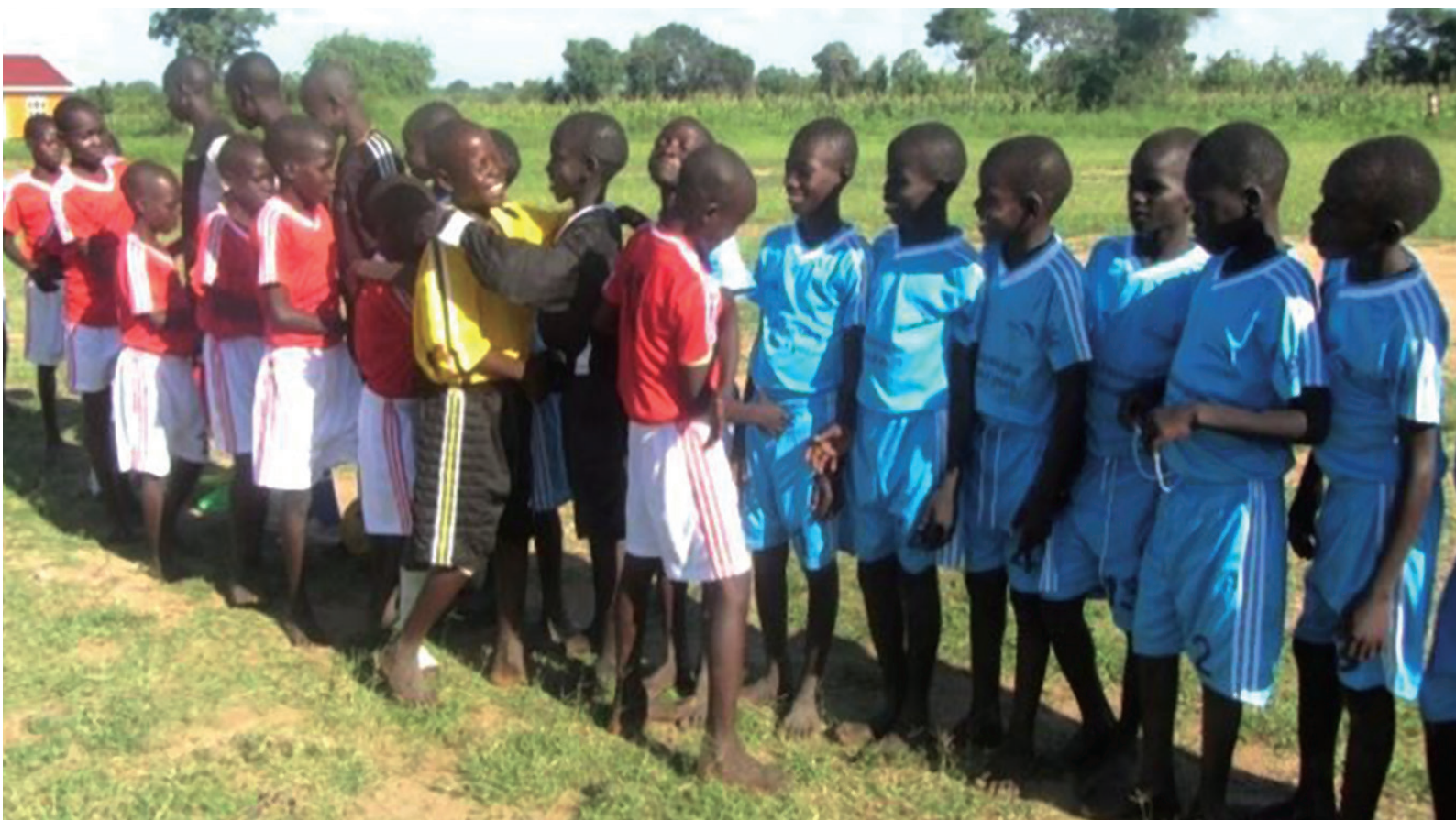
Children from both the host and refugee communities share hugs and joyous moments before engaging in a peace football match