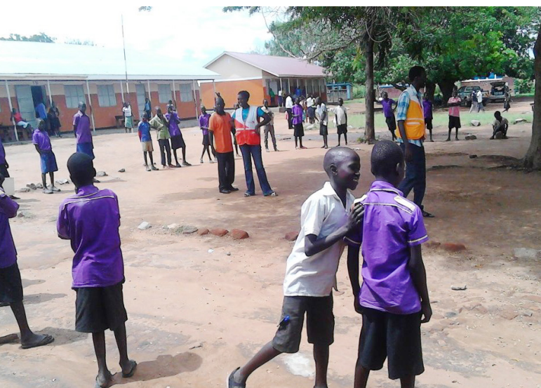
Children during a life skills session at school

Although English is the language of instruction at Mungula 1 Primary School, not all students understand it. Language was one of the causes of fights. Each moment the other spoke in their