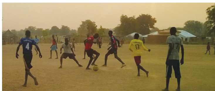
Adolescent boys during a football session at the child friendly spaces