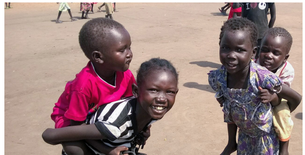
Girls with their siblings at the child friendly space in Nyumanzi refugee settlement-Adjumani.