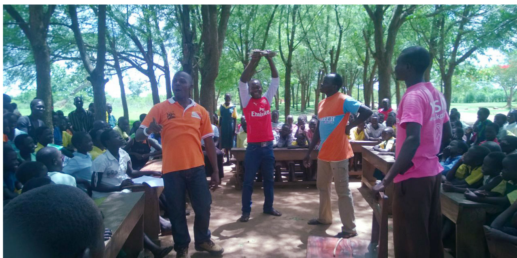
Selected adolescents engage in an illustration during a sensitization meeting for children

face—struggling to share the limited resources amongst those that are entitled to them. During the illustration exercise, the selected people did not manage to stand straight on their two legs each within the designated square. It was until they all agreed to hold each other and sometimes stand on one leg that they were able to fit in the square. This taught the community on the need to come up with mechanisms to support each other, cooperate and share the available limited resources with everyone. These mechanisms are important to enable people to live in peace and harmony. Children replicated these illustrations when sensitising their parents and other adults during their community outreaches and child-led initiatives.