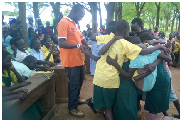
Children from Ajugopi in a participative game during a sensitisation on peace building

Another illustration used was for a group of people to fit within a small squared box that was drawn on the ground by the session facilitator. The square represented their community or village. They had to find suitable means of fitting within this space without displacing anyone. This could be equated to the challenge that communities often,