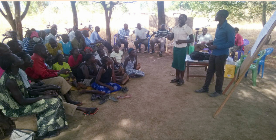
An adolescent girl from the host community engaging both refugee and host community members on peaceful co-existence.