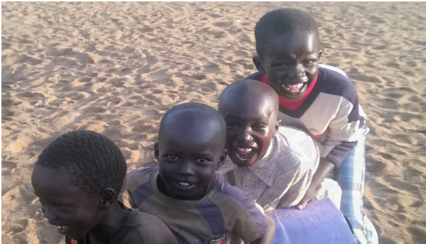
Siblings share a moment with friends while playing at the child friendly space.