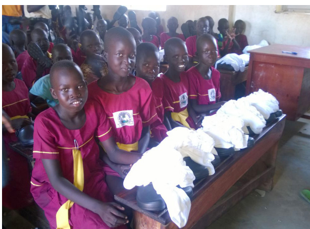
Girls from Alere Primary School with their T-shirts and plastic shoes donated by World Vision.

Sharing, forgiveness, and love are some of the important attributes children highlighted in helping them diffuse conflicts in communities and schools. During their child-led reflection meetings, refugee children and adolescents suggested that, if possible, there is need to share some of the items distributed to them with the host community children because some are even more vulnerable. They identified clothes, sanitary towels and plastic shoes as items that could be shared.