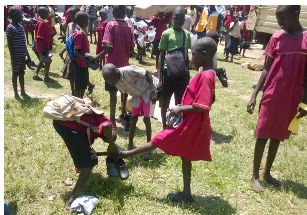
A Maadi boy helping a South Sudanese refugee girl in Primary I to identify a fitting shoe size.