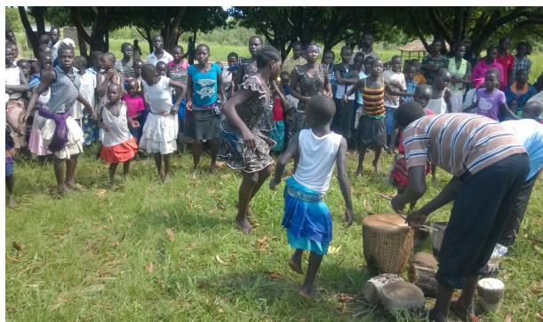
Children from Mungula 1 during a child led session to sensitise communities on peace building through music, dance and drama

“As a leader, I realise the benefit of engaging children in resolving issues. Having two school terms without a fight among children is amazing! Children now dance the cultural dance of other tribes they considered enemies.”