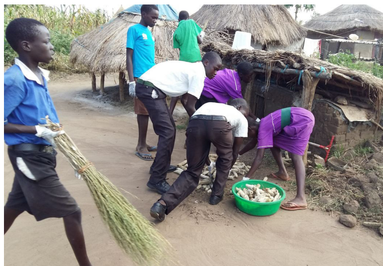
Children from Mungula I Peace Club during a sanitation outreach in a home of one of the elderly in the community