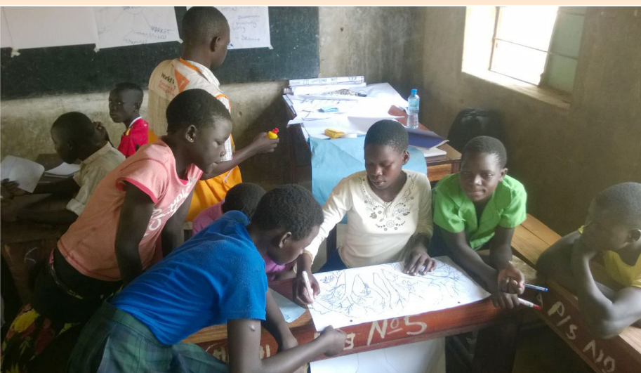
Adolescent girls in a session during the Empowering Children as Peace builders (ECaP) training.