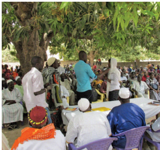
TOP LEFT: This tree nursery helps families boost their incomes so they can better provide for their children. BOTTOM LEFT: Thanks to you, more children are reading better. BOTTOM RIGHT: The community is learning together about children's rights and how to keep them safe.