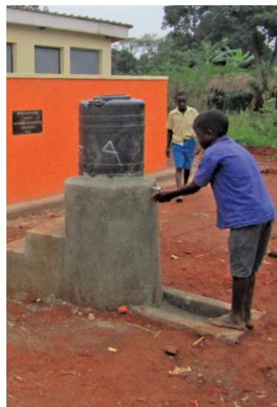
TOP LEFT: Thanks to you, three-quarters of children now stay on to complete their primary education. BOTTOM LEFT: 430 local children celebrate the Day of the African Child and learn to express themselves with dance and song. BOTTOM RIGHT: Thanks to you, students at the local school now have a handwashing area and know how to protect themselves from disease.