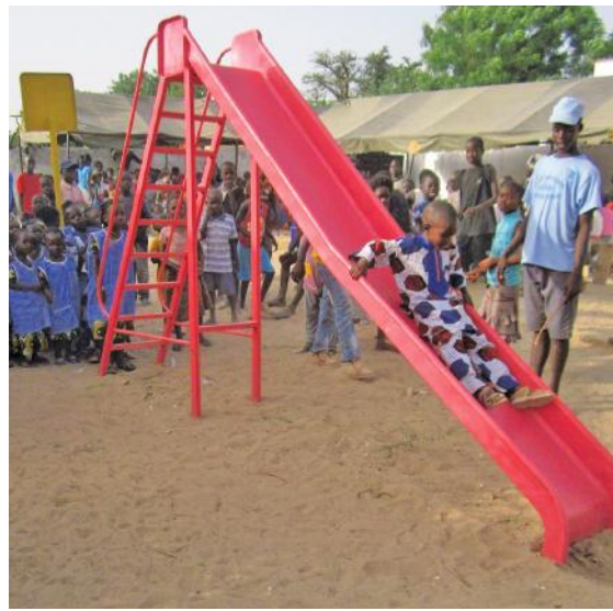
TOP LEFT: Women learn how to make local produce, including soap, to boost family income. BOTTOM LEFT: Thanks to you, babies are weighed regularly to check their health and help prevent malnutrition. BOTTOM RIGHT: These children now have a safe place to play with their friends, thanks to your support, and enjoy taking it in turns to go down this new slide.