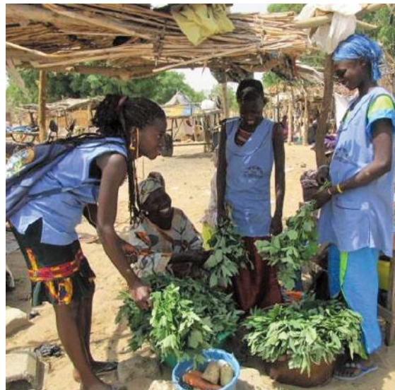
TOP LEFT: Children enjoy playing together at their new preschool open day. BOTTOM LEFT: Mothers attend a health session to learn how to best care for their babies and give them a safe start in life. BOTTOM RIGHT: Local women have boosted their incomes by setting up their own businesses, thanks to you.