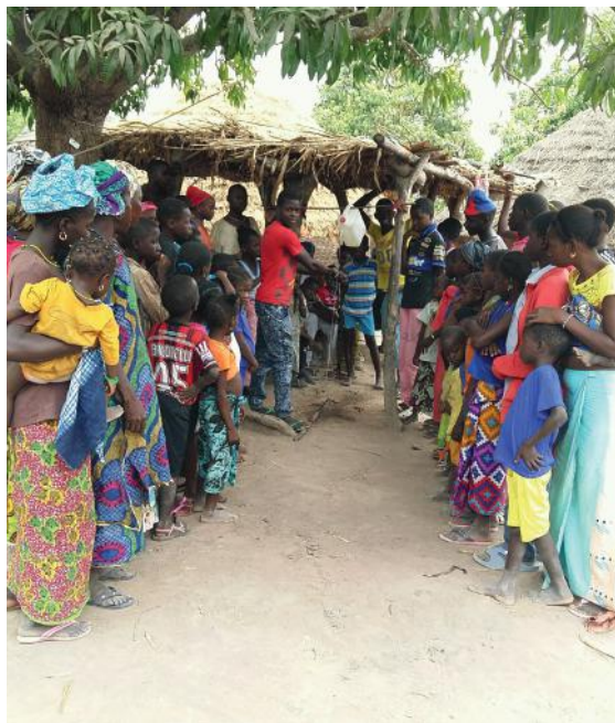
TOP LEFT: Thanks to you, savings groups like this one are changing women's lives. It means they can earn a small income to better care for their children. BOTTOM LEFT: More babies get life saving immunisations, thanks to you. BOTTOM RIGHT: Children and their parents gather round to see how to use a 'tip-tap' to wash their hands, so they can stay healthy.