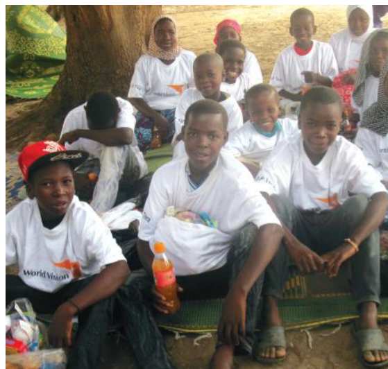
TOP LEFT: This is the dry-season garden, where, thanks to you, families are able to grow more nutritious food. BOTTOM LEFT: Young women learning at the new sewing centre. BOTTOM RIGHT: At the African Child Birthday Celebration, children came to learn, celebrate and enjoy playing games with their families and friends.