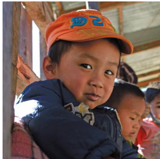
TOP LEFT: Thanks to you, children enjoy better health and can go to school. BOTTOM LEFT: Thanks to better water supplies, equipment and training, families grow and sell vegetables year-round. BOTTOM RIGHT: Children enjoy a healthy lunch at the childcare centre, thanks to you.