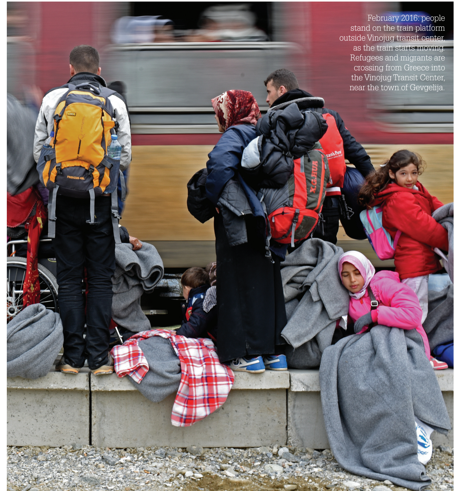
February 2016: people stand on the train platform outside Vinojug transit center, as the train starts moving. Refugees and migrants are crossing from Greece into the Vinojug Transit Center, near the town of Gevgelija.

While the SDGs, along with the Paris Agreement, are likely to be the most rigorously tracked accords of the 2030 Agenda, the goals present a number of monitoring challenges. Because of the SDGs’ non-binding nature, countries have the freedom to opt out of targets or indicators. Moreover, while the large number of indicators allows credible monitoring of all 169 goals, roughly half of