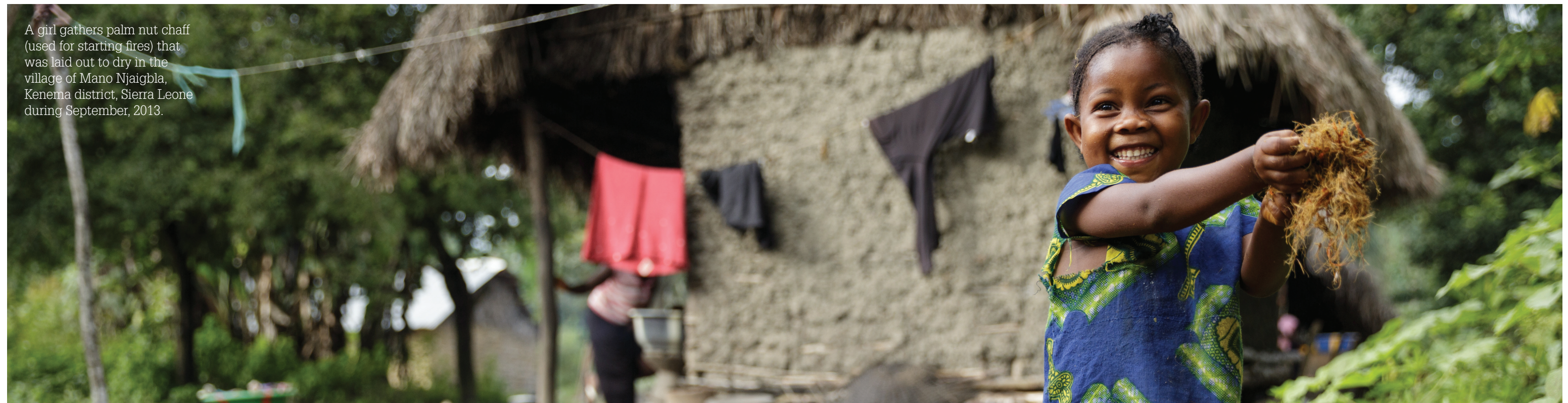
A girl gathers palm nut chaff (used for starting fires) that was laid out to dry in the village of Mano Njaigbla, Kenema district, Sierra Leone during September, 2013.

There is little guidance for assessing the quality of participation, to assure that it is meaningful rather than nominal, and few references to the well-established toolkit for promoting it. Relevant SDG indicators focus on representativeness of public institutions with regard to gender, age, ability, and population groups (16.7.1), perceptions that decision-making is inclusive and