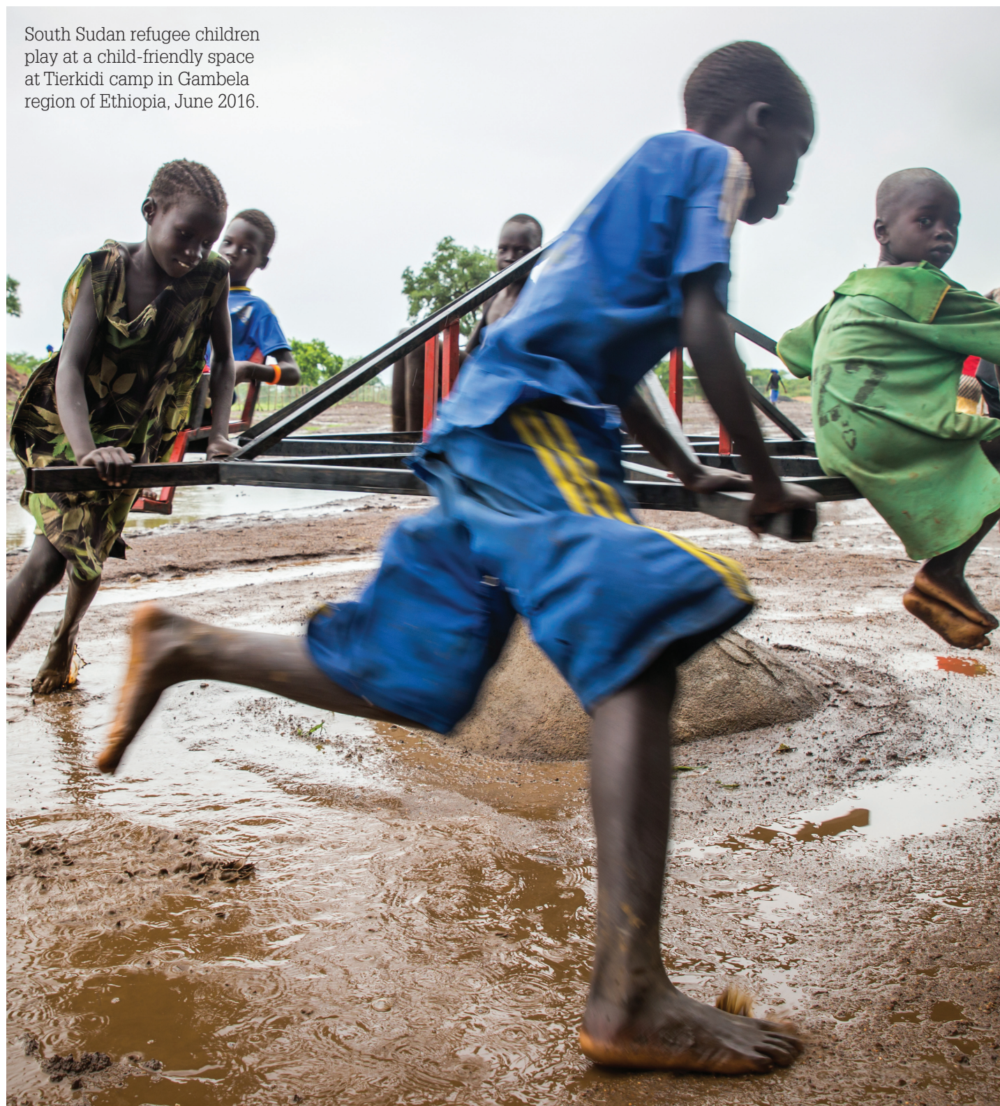
South Sudan refugee children play at a child-friendly space at Tierkidi camp in Gambela region of Ethiopia, June 2016.