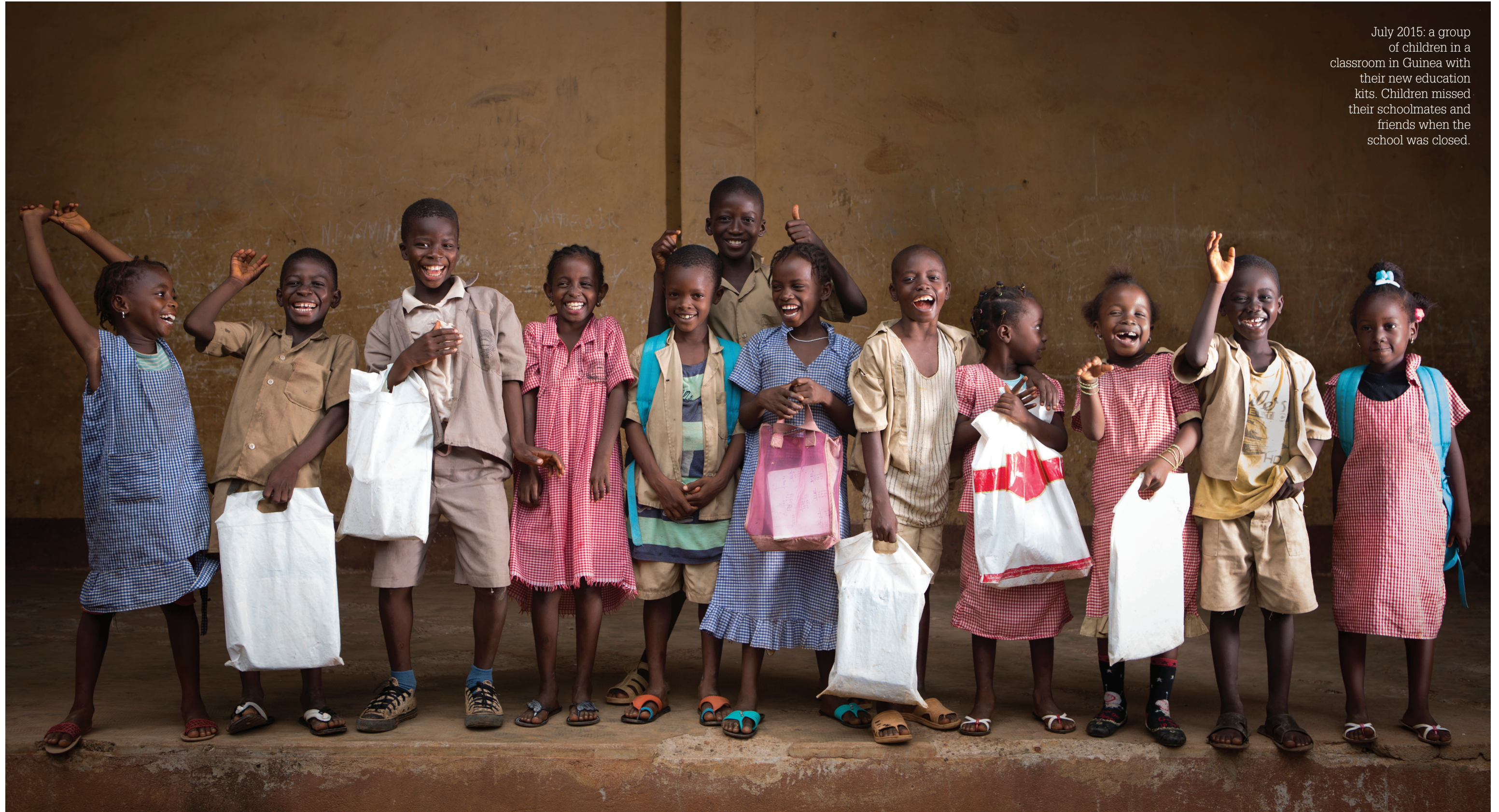
July 2015: a group of children in a classroom in Guinea with their new education kits. Children missed their schoolmates and friends when the school was closed.