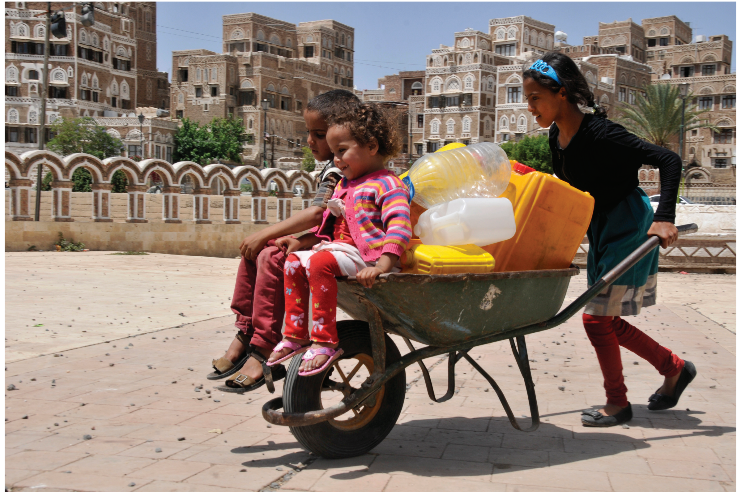
May 2015: a girl pushes two younger children in a wheelbarrow that also bears several jerrycans in Sana'a, the capital of Yemen

New Urban Agenda (Draft): “We reaffirm our pledge that no one will be left behind, and commit to promote equally-shared opportunities and benefits that urbanization can offer, and enable all inhabitants, whether living in formal or informal settlements, to lead decent, dignified, and rewarding lives and to achieve their full human potential” (25/p.5).