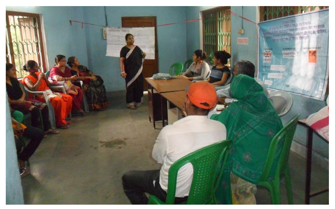
Meeting with Stakeholders to discuss indicators for providing feedback.

Tracking feedback and ensuring it is referred and the feedback acted on, is also an area which is extremely important for ensuring that the loop functions properly but tracking feedback is often challenging as well, especially if the feedback is informal and in some instances field staff may feel too overwhelmed with this extra task on top of their other tasks as often this function does not have a specific staff assigned.<sup>29</sup>