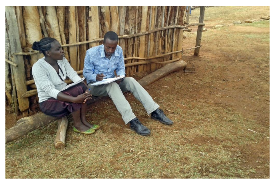
Community Feedback Officer meeting Health Worker for feedback survey in Ethiopia.

The enabling environment can be further bolstered through increased capacity. This means assigning resources in terms of funds and staff time as well as building awareness and capacity of staff and communities at the design stage of CFRS. It has helped create ownership and buy-in, for example in Ethiopia, use of community volunteers as a way of collecting and responding to feedback has been popular and worked well. One community volunteer noted: "There is change. But it's us and the community. We engage the community all the time. It is because of us and the logbook that change happens." Involving other staff members and specialists as well as integrating community feedback in DME reporting checklists and standing items for staff meetings has also built awareness of the importance of feedback coming to programme staff. Assigning resources in terms of staff time and funding for flexibly using multiple methods for providing feedback including different technological solutions has meant that when feedback systems need to be adapted based on the uptake of communities it can be done relatively easily instead of going through many hierarchies of approvals. For example in Somaliland, the BFM pilot discovered that the community is not really using SMS and therefore introduced a missed call call-back service and hotline number, which then helped them receive more feedback.