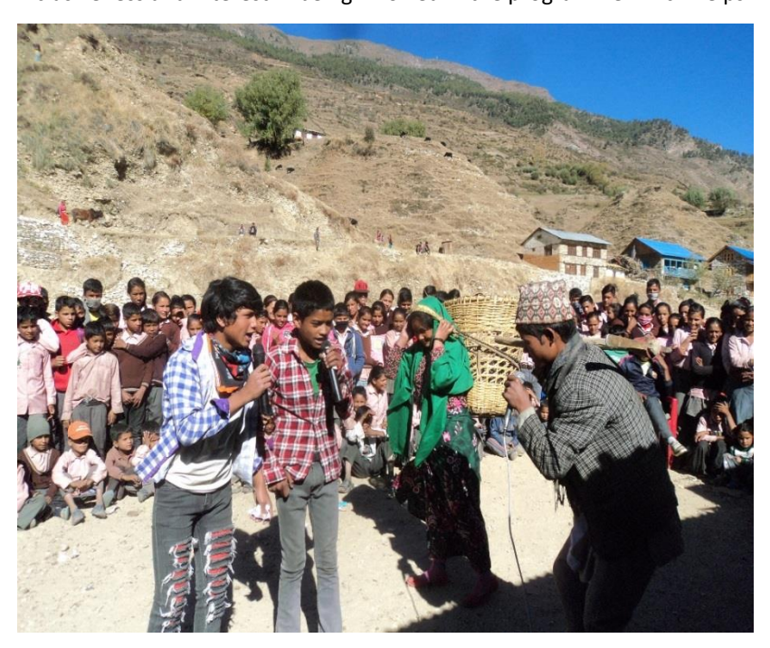
Awareness Raising on Community accountability of WVI Nepal through street drama in local language by child clubs.

There has been appreciation of the ALI in Nepal in including children's feedback as this is still an area where development agencies have much work to do. As one child noted in the recent project evaluation: "People/organisation usually ignore about children roles for sharing information, school neglect our voices, parents overlook our suggestion, but after feedback mechanism installation the organisation tends to respect our feeling and inspire us for effective roles." Therefore, accountability to children helps in their sense of inclusiveness and interest in being involved in the programme which helps in building trust with children.<sup>6</sup>